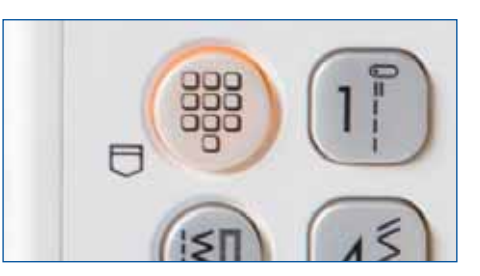
My favourite stitch

Simply key in the number of the preprogrammed stitch you would like to use.